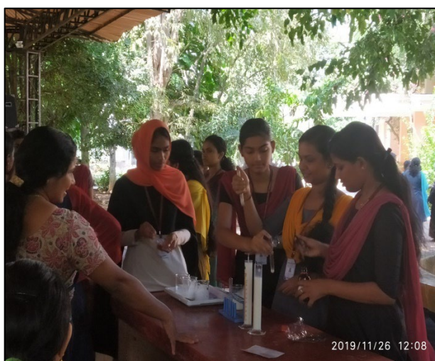
Demonstration of easy adulteration tests in milk