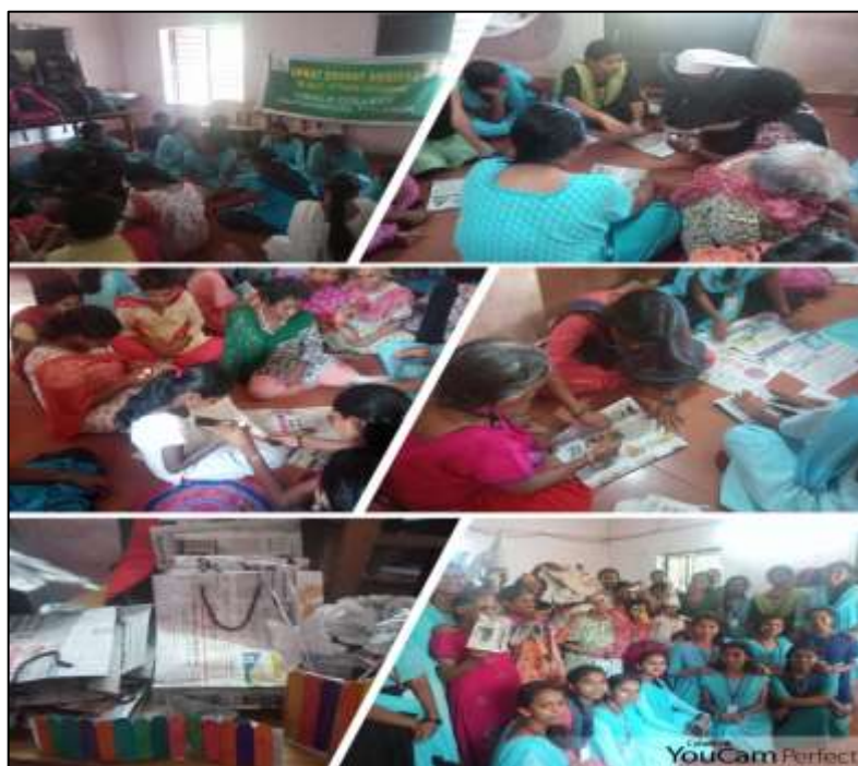
Training on Craft Making for Mentally Retarded Women Inmates of PrathyasaBhavan