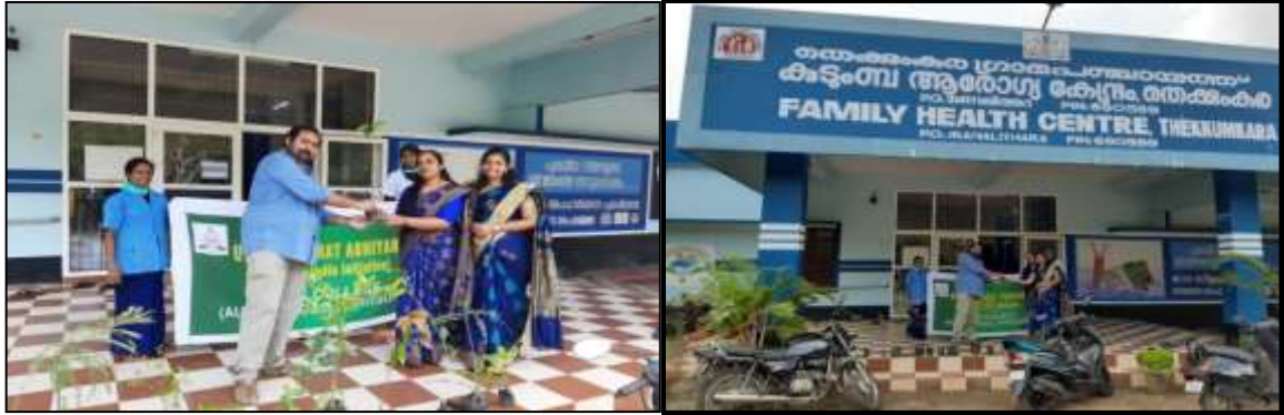
Donating 15 tree saplings to the Primary Health Centre, Thekkumkara