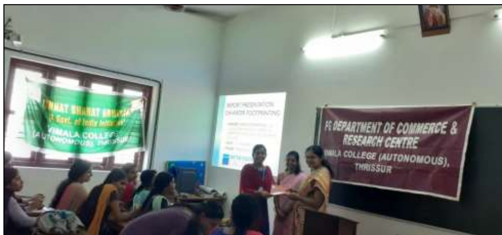
Water Management Survey at Mulankunnathkavu Grama Panchayath