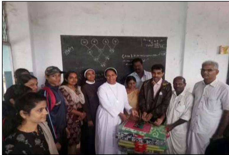
Paya (Mat) Distribution to Relief Camp at Villadom School, Thrissur