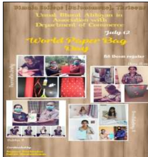
Paper Bags of UBA