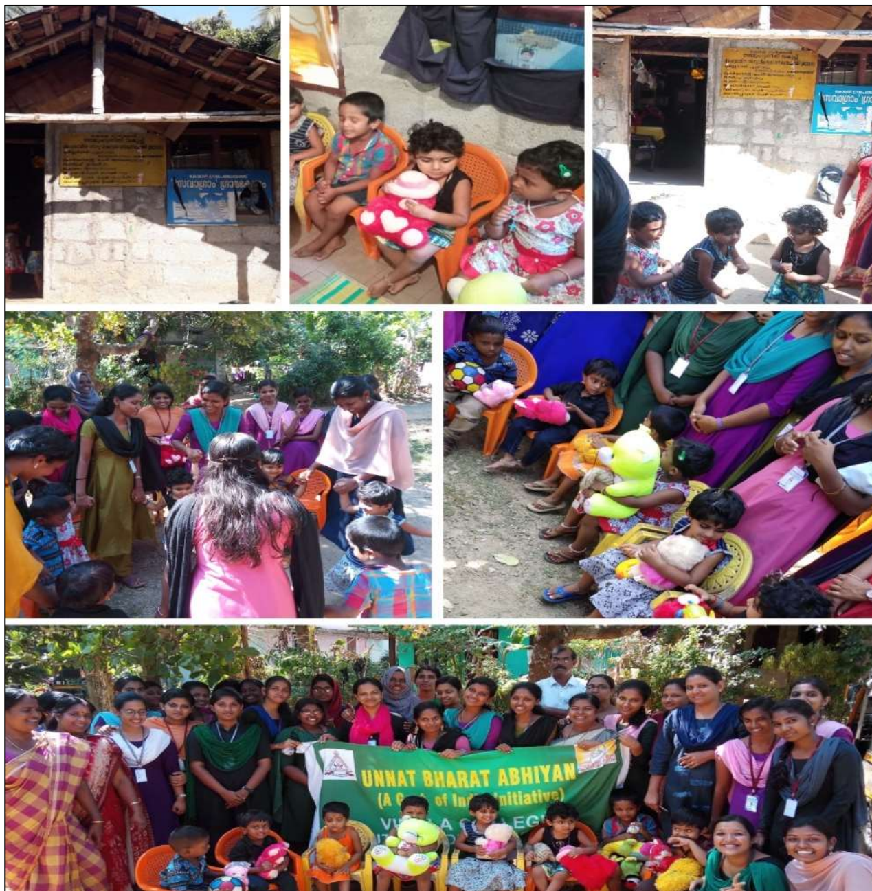
Distributing Toys and Story Books to the Children at Anganwadi