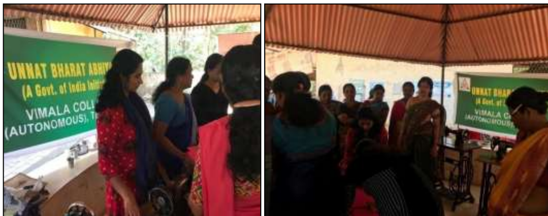
Cloth Bag Making Training Programme