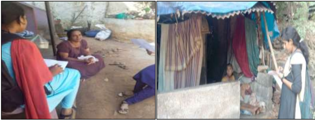
Baseline Survey in UBA Villages and Need Assessment Analysis