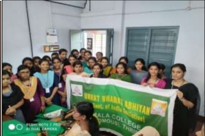
Cloth bags made by UBA team