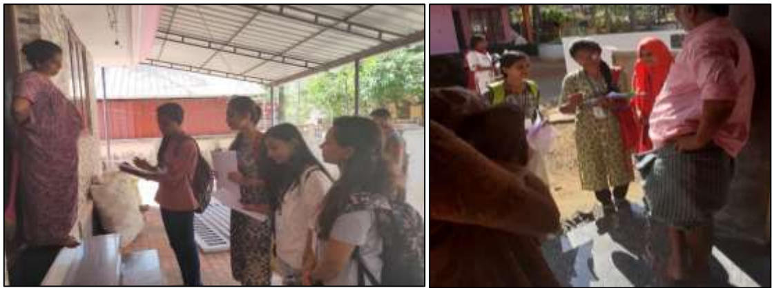
Conducting Survey on Plastic Waste Management