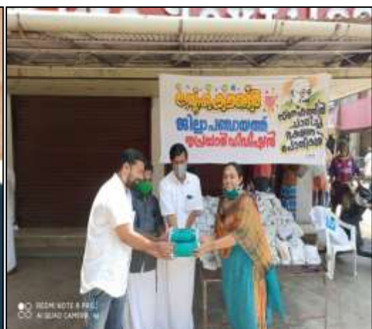
Mask Distribution by UBA during Covid 19 Pandemic to Emergency Services like Police Officials, Panchayat Officials, Asha Workers and Health Workers