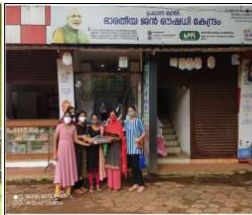
UBA team is distributing paper bags to the medical stores at Different parts