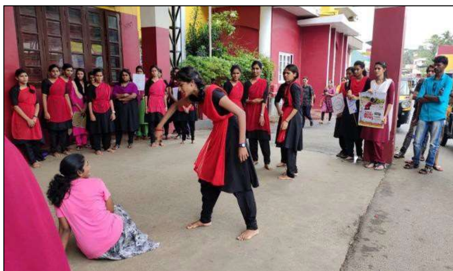
Performed street play