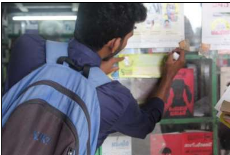
Students pasted anti child labour message stickers in all shops in bus stand and auto rickshaws