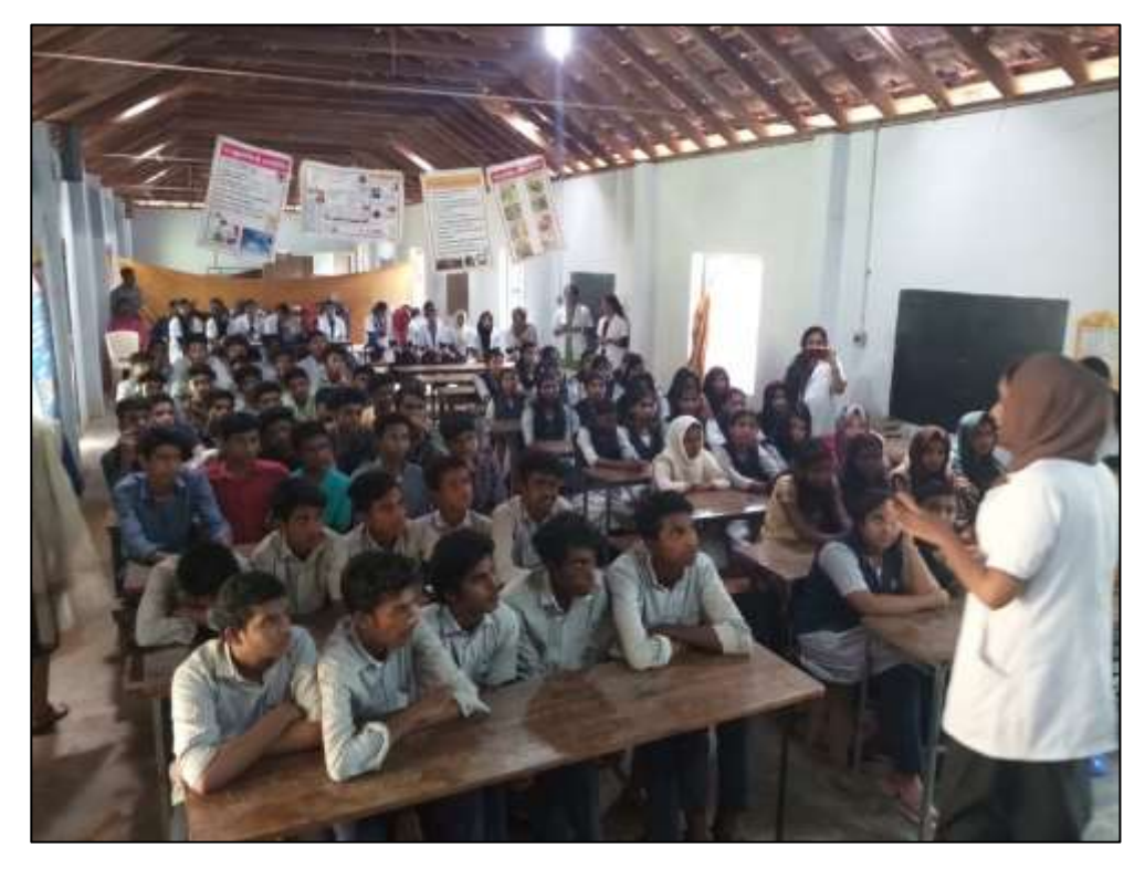
Students attending nutrition education programme at Govt.H.S. School, Kottathara