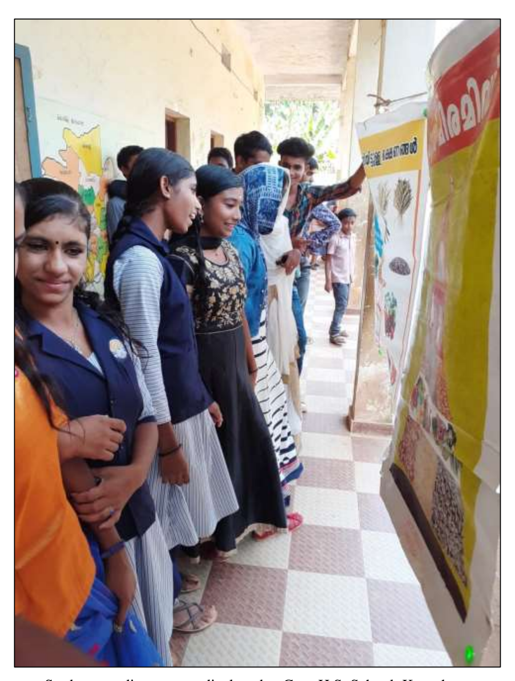
Students reading posters displayed at Govt.H.S. School, Kottathara