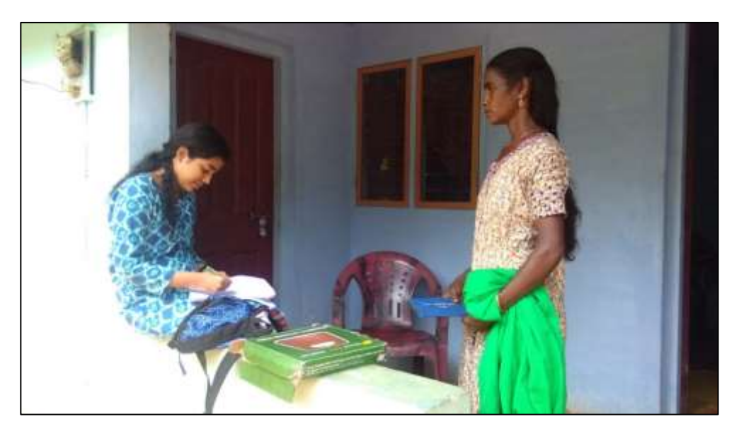
A student taking nutritional survey