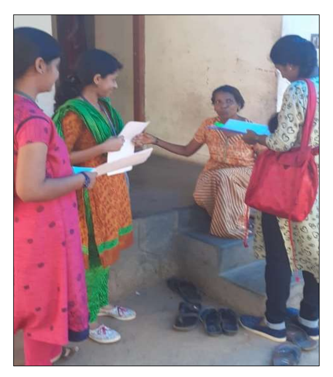
Students taking survey on plastic waste management