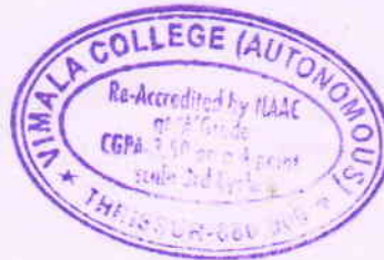
SIGNATURE OF PRINCIPAL INVESTIGATOR

8. It is certified that the grant of Rs.70,000(Rupees Seventy Thousand only) received from the University Grants Commission under the scheme of support for Minor Research Project entitled " A STUDY ON THE WORK ENVIRONMENT OF FEMALE SALES FORCE IN TEXTILE AND GARMENT RETAILING WITH SPECIAL REFERENCE TO KOCHI THE COMMERCIAL AND INDUSTRIAL HUB OF KERALA " vide UGC letter No. F. 2260-MRP/15-16/KLCA027/UGC-SWRO dated 25 th April, 2016 has been fully utilized for the purpose for which it was sanctioned and in accordance with the terms and conditions laid down by the University Grants Commission.