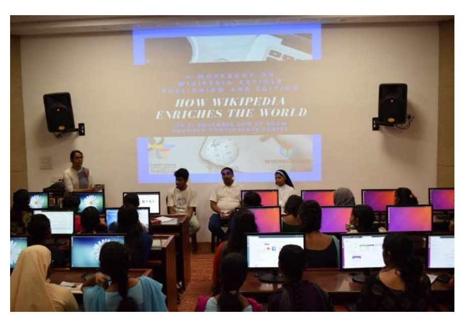
Lectio 2020: One day seminar

One day workshop on Wikipedia Content Writing: A one day workshop on 'Wikipedia Content Writing and Editing was organized on 13<sup>th</sup> December 2019.