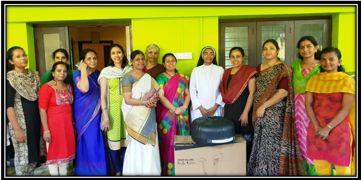
Handing over gym equipments to the Autism Centre, Chembukkavu on December 22 nd 2018.