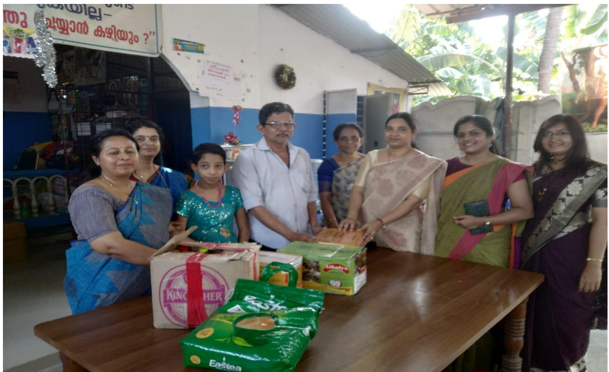
The executive members visited Ashraya Bhavan on 09-01-2020 which is a rehabilitation project dedicated to the welfare of old aged people. We supported them by supplying grocery and other items to the Centre, generously contributed by alumnae and teachers of the College.