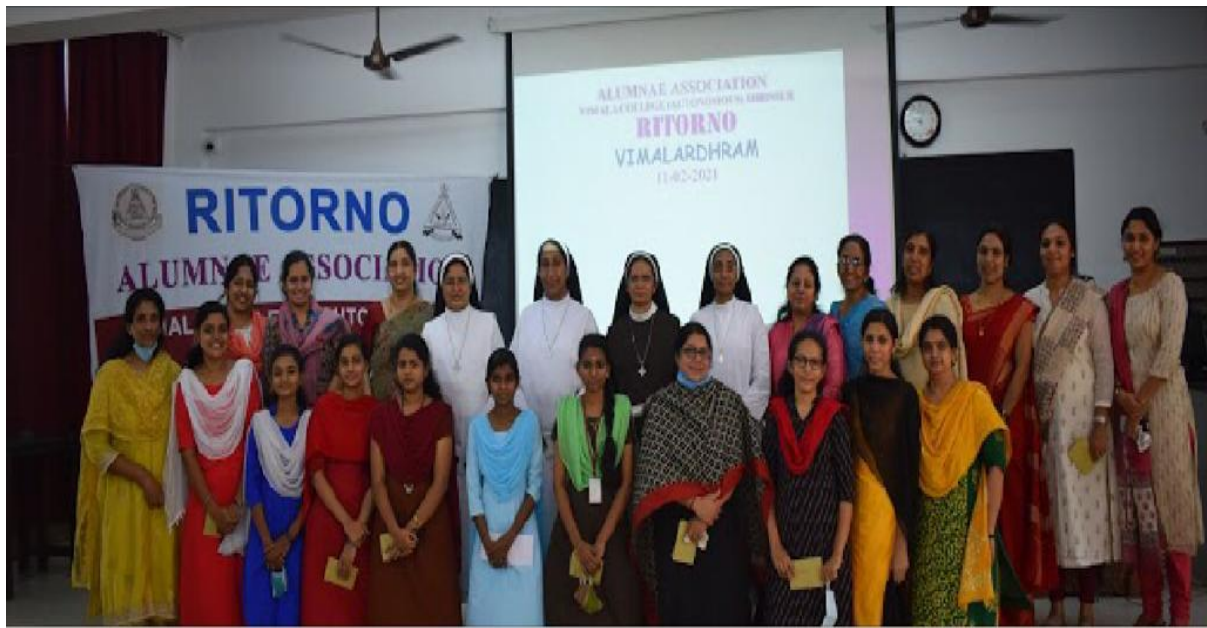
Financial support during Covid 19 pandemic, to the needy students of our college in February 2021.