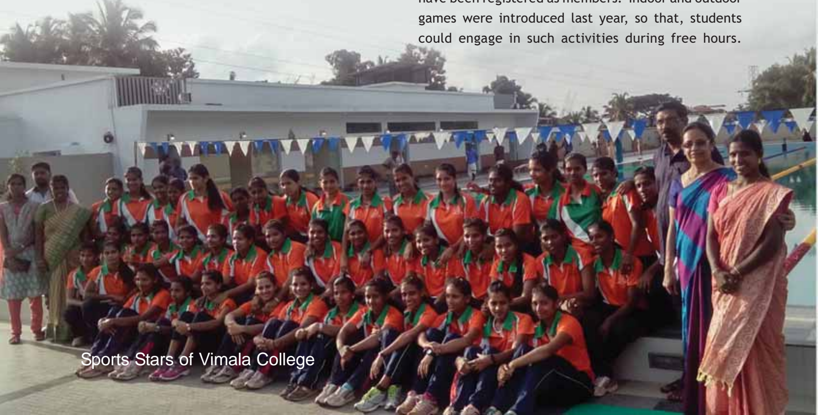
Sports Stars of Vimala College

The Department of Physical Education has formed the Recreation Club in which all the students have been registered as members. Indoor and outdoor games were introduced last year, so that, students could engage in such activities during free hours.