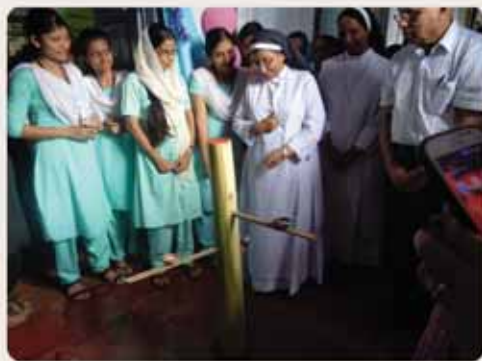
The flame test experiment opens Chemclave organised by the Department of Chemistry as part of Science Gala