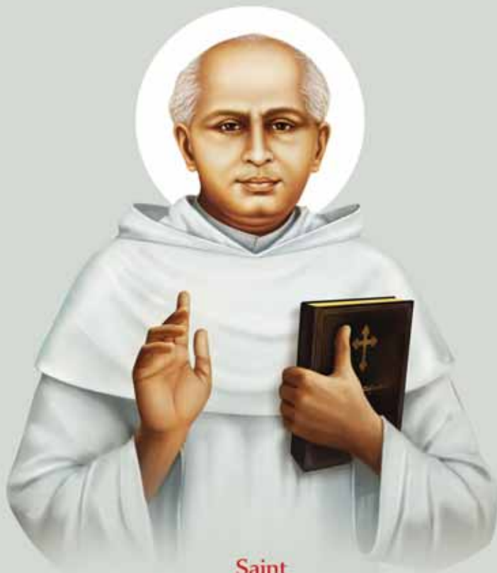
Saint Chavara Kuriakose Elias