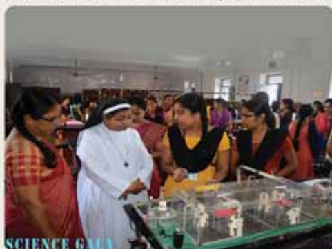
SCIENCE GALA Eye to Sky, the sky watch programme organised by the Department of Physics in association with the KSCSTE and Kerala State Science and Technology Museum, Thiruvananthapuram attracted star gazers and moon watchers.