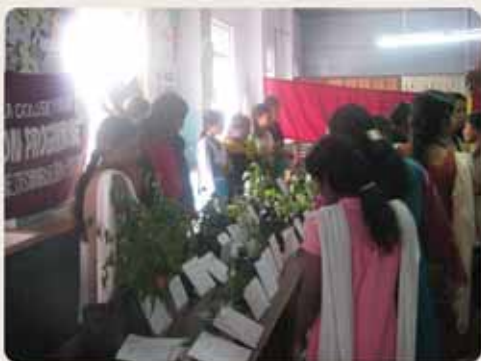
Department of Botany set up an exhibition of medicinal plants as a part of Science Gala.