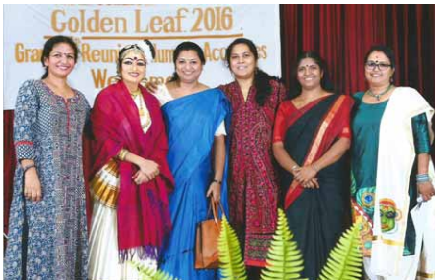
When the College Union of the Silver Jubilee year met for the Golden Jubilee Celebrations

sorrows being lessened, promises of never losing touch again being given - all punctuated with expressions of love, joy, surprise and even disbelief.