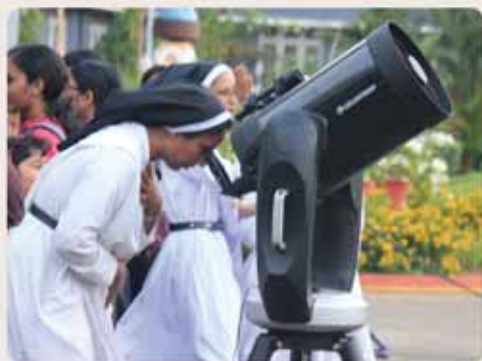
The annual Physics exhibition Physigala was conducted in collaboration with the Science Gala for the Golden Jubilee year.