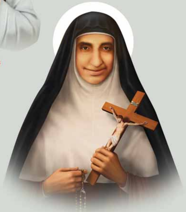
Saint Euphrasia of the Sacred Heart of Jesus