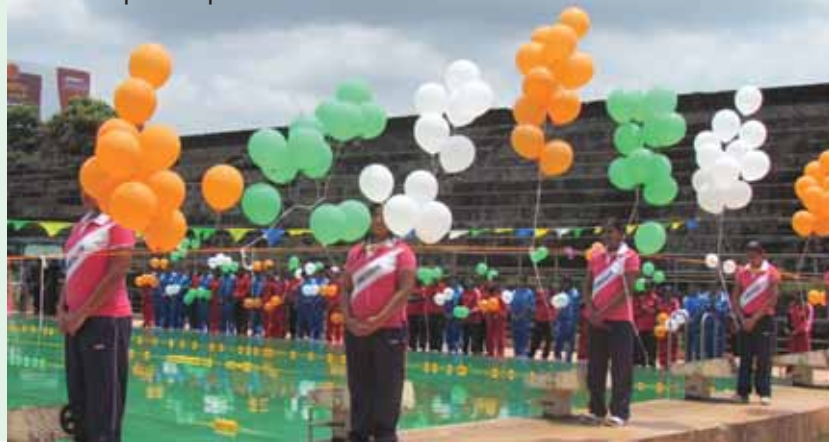
The inauguration ceremony of the Calicut University Intercollegiate Aquatics Championships