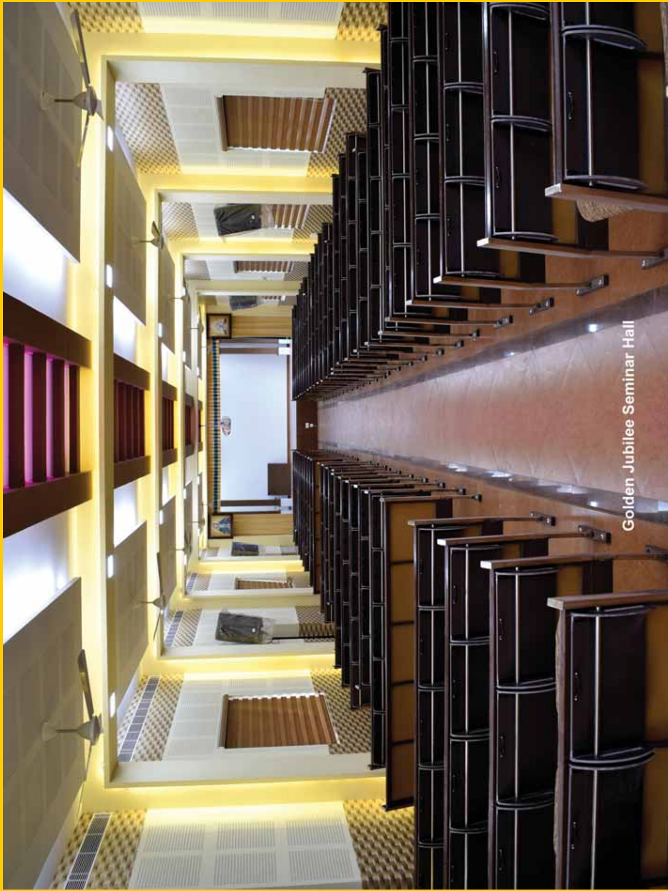
Golden Jubilee Seminar Hall