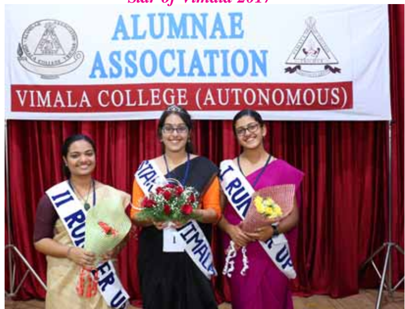
Star of Vimala 2017

The warmest scenes, however, were off the stage and bereft of the artificial sheen of the glaring lights. These were unfolding in the auditorium and in the corridors of the campus. Separated friends meeting up, life events being exchanged, profession and careers being jokingly compared, accomplishments being shared,