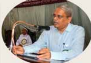
An enthralled audience is all ears to the words of Padma Bhushan Sri. Kris Gopalakrishnan, Co-Founder, Infosys.