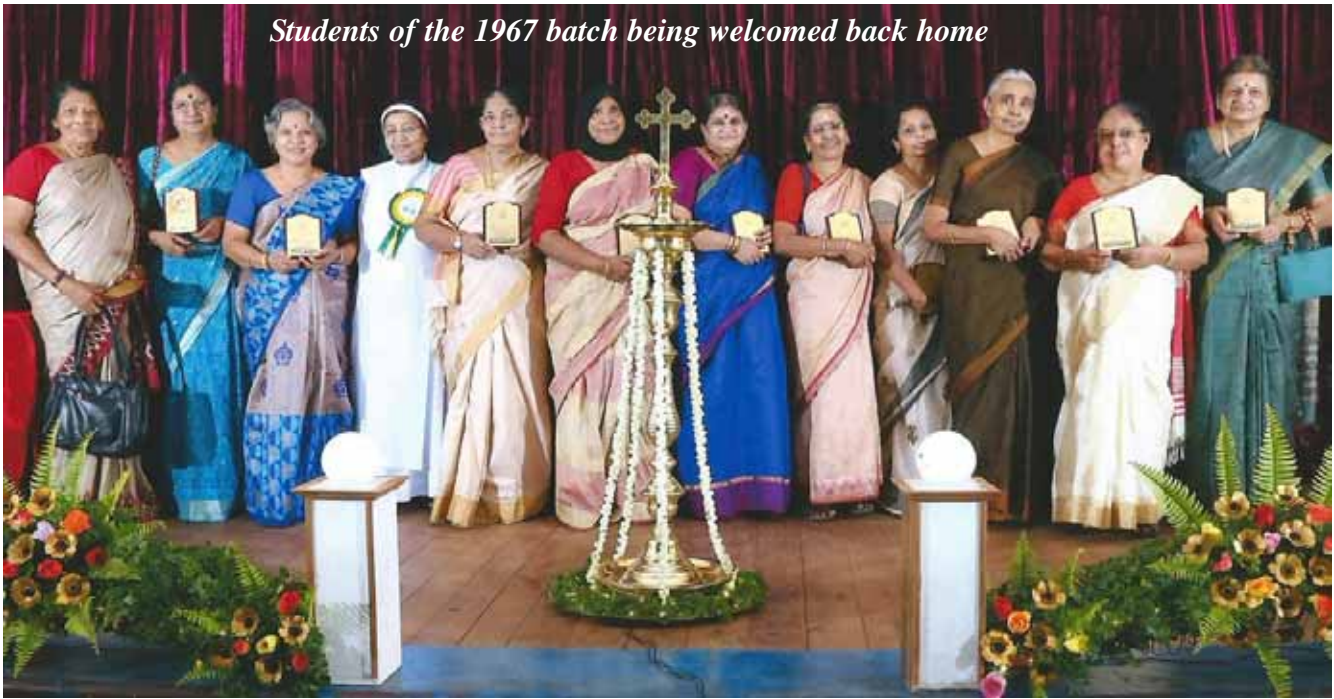
Students of the 1967 batch being welcomed back home