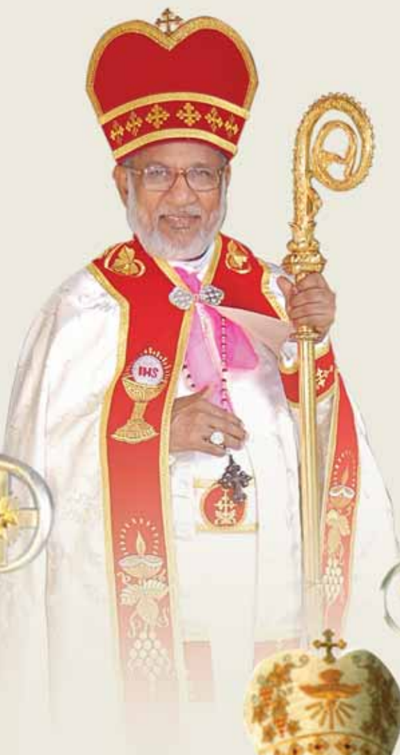
George Cardinal Alencherry Major Archbishop of the Syro-Malabar Church