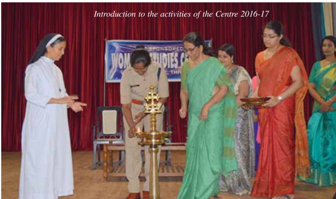
Introduction to the activities of the Centre 2016-17

To organize awareness and capacity building programmes for students as a part of the certificate course in Gender Sensitization in collaboration with different institutes