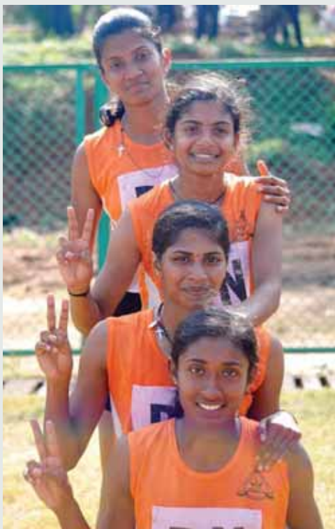
4 x 400 Relay Vimala College Team

Same is the case with Judo, Weightlifting and Athletics. Every year, students participate in ten to twelve games in the Calicut University Intercollegiate championships. The Department also organizes Intercollegiate championships in swimming, judo, weightlifting, fencing, yoga (Men & Women), kabaddi, handball, softball, tug of war etc.