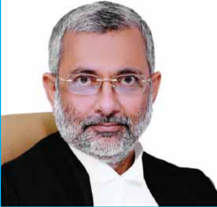
ജസ്റ്റിസ് കുര്യൻ ജോസഫ് ജഡ്ജി, സുപ്രീം കോർട്ട്

2007-2010 വരെ കുടുംബകോടതികളിൽ 3000ത്തോളം കുടുംബപ്രശ്നങ്ങൾ കൈകാര്യം ചെയ്തിട്ടുണ്ട്. എന്റെ നയ മനുസരിച്ച് എല്ലാവരെയും കോടതിയിലേക്ക് വിളിക്കാറുണ്ട്. എല്ലാ പെൺകുട്ടികളോടും അവർ പഠിച്ച കോളേജിനെക്കുറിച്ചാണ് ആദ്യം ചോദിക്കാറുള്ളത്. കാരണം എവിടെ പഠിച്ചുവെന്നറിഞ്ഞാൽ കൈകാര്യം ചെയ്യാനുള്ളപ്പമുണ്ട്. ഭാഗ്യവശാൽ ഇന്നുവരെ വിമല കോളേജ് എന്ന് പേര് കേൾക്കാറിട്ടയിട്ടില്ല. അത് നിങ്ങൾക്കുള്ള അഭിനന്ദനമായി അറിയിക്കുന്നു.