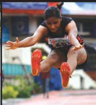
Sruthilekshmi National Level Athlete