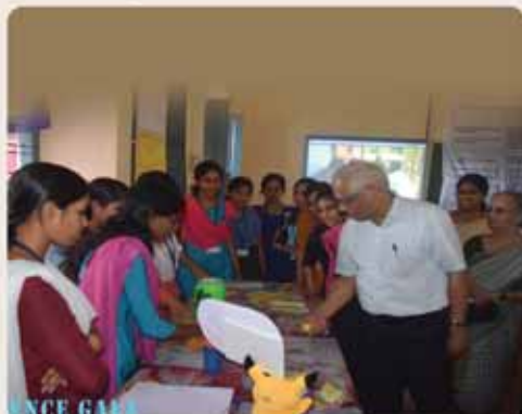
SCIENCE GALA An array of activities launched by the Department of Computer Science in association with the Scholastic Conclave in Science including the exhibition titled Tech Voyage.