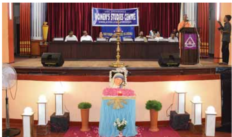
Mother Theresa commemoration day 2016-17

To develop and promote in collaboration with other