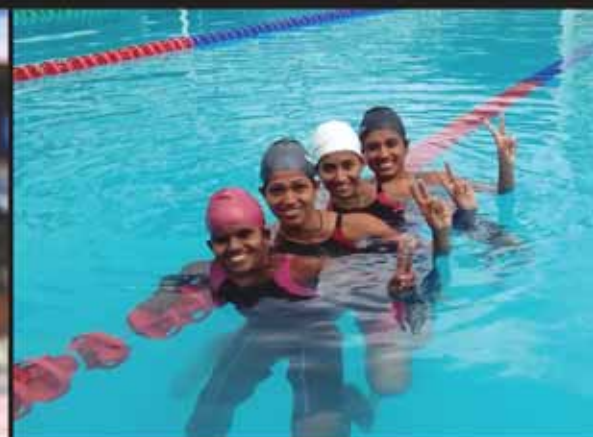
Vimala College won the Second place in Swimming

“Cycling inside the campus” with an aim to promote cycling and to make the body fit through aerobic type activity was begun this year. Students can use the cycle during lunch break and after College hours.