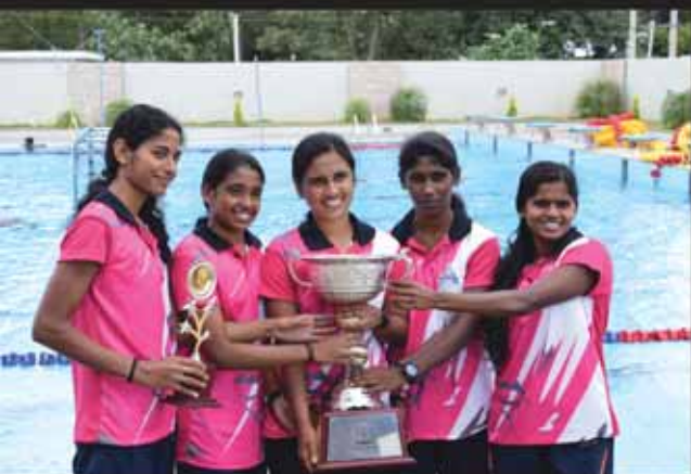
Winners of Intercollegiate Aquatics 2017-2018