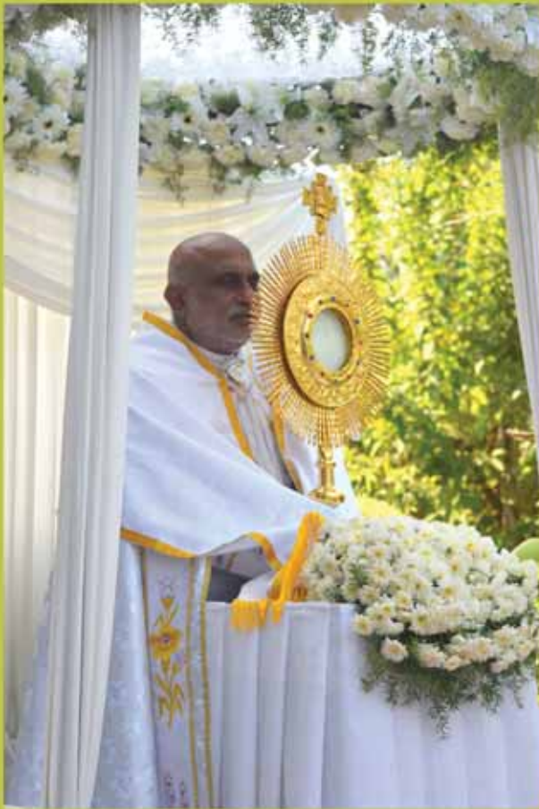
The Eucharistic Procession