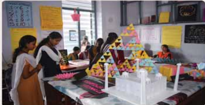
An entire world of statistical theories and their applications were opened up to spectators at Vista 2K16 organised by the Department of Statistics in collaboration with the NSSO, Thiruvananthapuram.