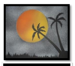
Uma .N (S4)