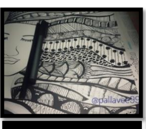
Pallavi .M (S4)