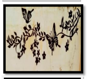
Sreelakshmy .R (S4)