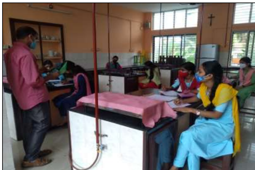
KEFTA Conducting Exam at Vimala College