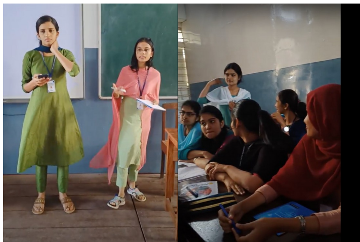
Discussion on Climate Change

improve student's understanding of what it is and how to respond to it.