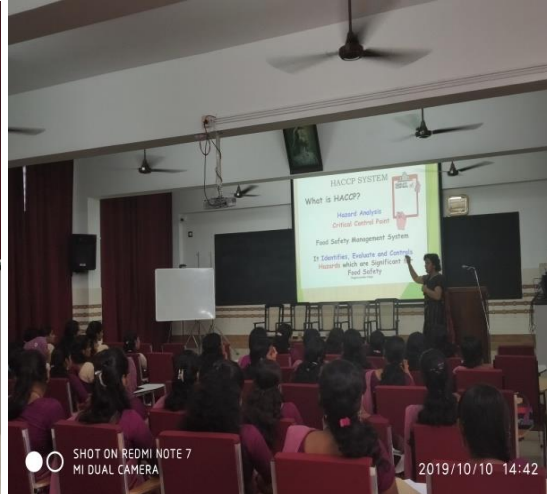
Session by Smt. Nimmy Sunil