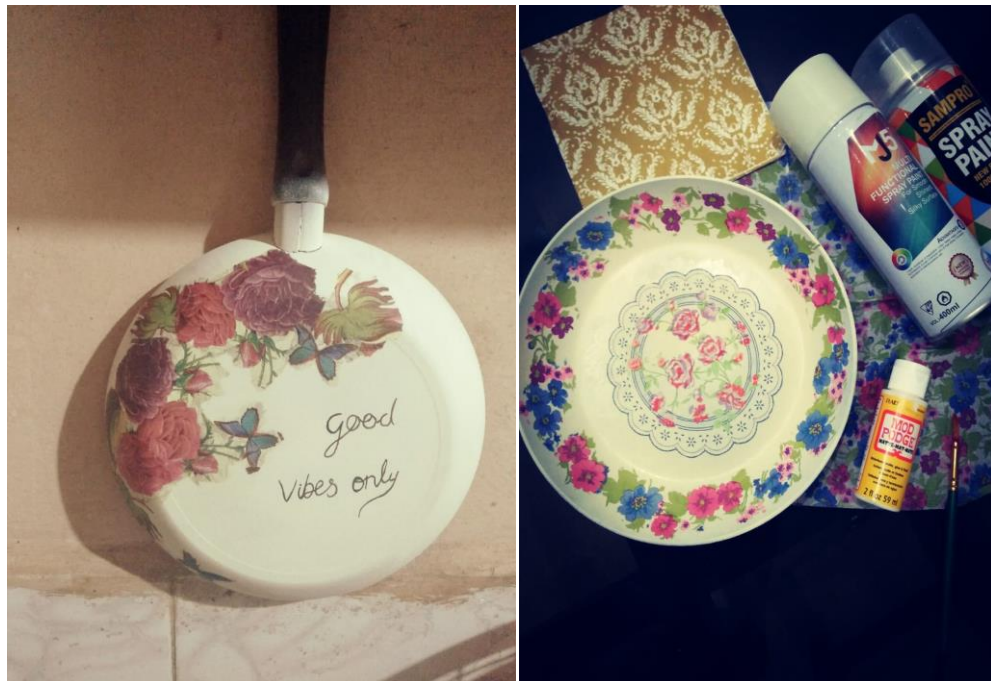
Workshop glimpses- products display